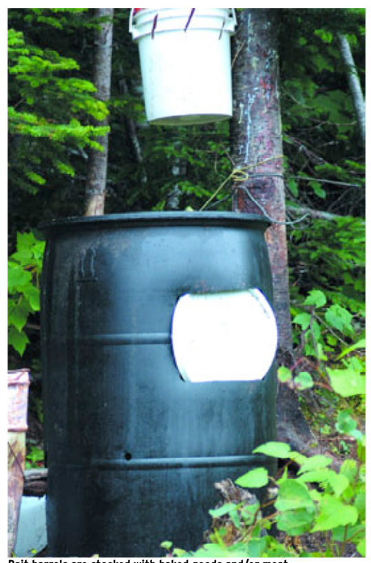
Bait barrels are stocked with baked goods and/or meat

Although we discovered soon after that my shot hit its intended mark and that the animal wouldn't be going too far, I wasn't taking a chance on having to track it in the woods just before dark, so I quickly raised the gun, aimed and fired just as he entered the woods, lodging the 180-